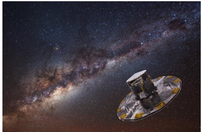
Image caption: Artist’s view of the Gaia satellite in front of the Milky Way.

The Belgian participation to the Gaia mission has been made possible through funding provided by the Belgian Federal Science Policy Office (BELSPO) via the PRODEX Programme of ESA.